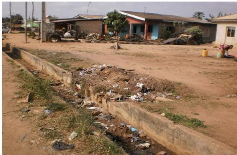
Figure-3. Damage drainage system.

The Table 2 reports major findings of the study. The likelihood ratio (0.0014) as revealed in the table indicates that all the slope coefficients of the study model are not simultaneously equal to zero. All the model predictors' coefficients are greater than zero thus, ensuring that the model adequately fits the study data. These further exhibits appropriateness of the study logit regression model. Moreover, all predictors except land map variable are in addition statistically significant. This information is revealed in Table 2 and Table 3 .