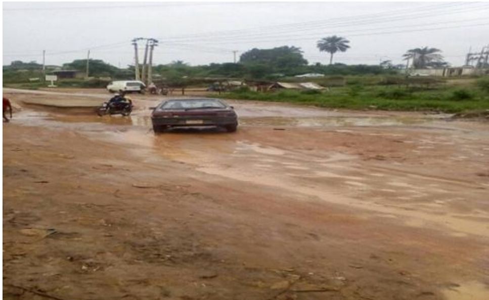
Figure-2. Road from Owode to Ado-odo Ota.