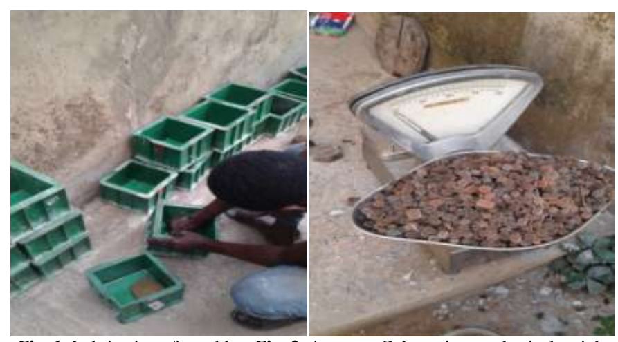
Fig. 1. Lubricating of moulds Fig. 2. Aracaura Columaries on physical weigh Scale

The concrete plastic moulds were used for the experiment, cleaned and oiled before each moulds were used. Total of sixty (60) concrete cubes of 150mm x 150mm x 150mm were produced with a mix ratio of 1:2:4 which was done in batching. The concrete cubes were de-moulded after 24 hours of casting. The de-moulded concrete cubes were move into curing tank. The cubes were removed from curing tank at the end of 7<sup>th</sup>, 14<sup>th</sup>, 21<sup>st</sup> and 28<sup>th</sup> day and air dried for about 3 hours before testing. The cubes were weighed after removing from curing tank and weighed again after air dried testing and the density of the cubes at different time was measured a day to the period of testing The partial replacement of granite with Aracaura Columaries (ACS) were in percentage of 0%, 5%, 10%,15% and 20% for each of the percentage, total of three (3) cubes were produced. Compressive strength of the cubes were tested in accordance to [5] with the use of matest digital compression machine.