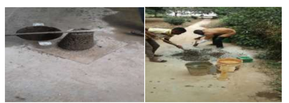
Fig. 7. Slump test of the concrete