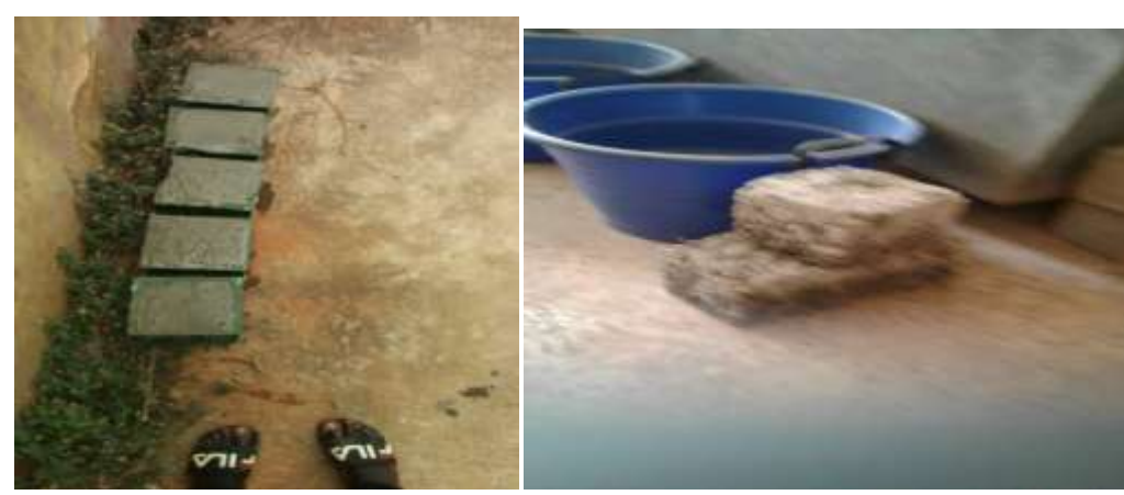
Fig. 9. Fresh concrete in the moulds