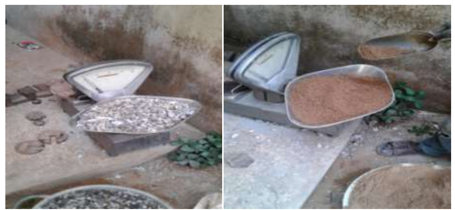
Fig. 5. Granite on the physical weigh scale Fig. 6. Sharp Sand on the physical weigh scale