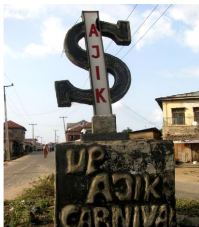
Figure 15: Ajik monogram Concrete and Plastic, (65cm), 2009, Ajitadun, Abeokuta