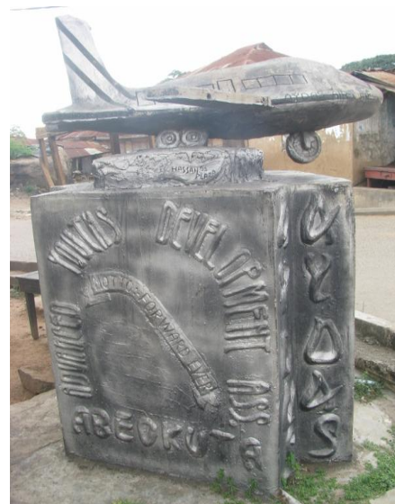
Figure 2: Hassan Plaza, Jet Age , Concrete, (75cm), 2000, Emere, Abeokuta