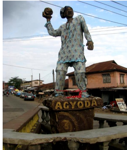
Figure 9: Sculpture with Buba and Sokoto, Concrete, (185cm), 2011, Ago Oko/Ijemo Agbadu Junction Abeokuta

Photograph: Paul Seyi-Gbangbayu, 2012 Photograph: Paul Seyi-Gbangbayu, 2012