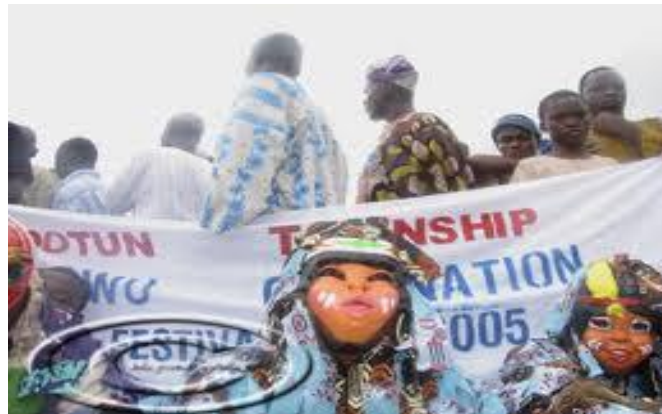
Figure 3: Adedotun One of the Carnival Groups in Procession, Abeokuta, 2005 Photograph: Seton Photos Abeokuta, 2005