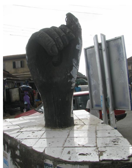
Figure 7: Unity , Cement, (60cm), 2009, Kugba Junction, Abeokuta