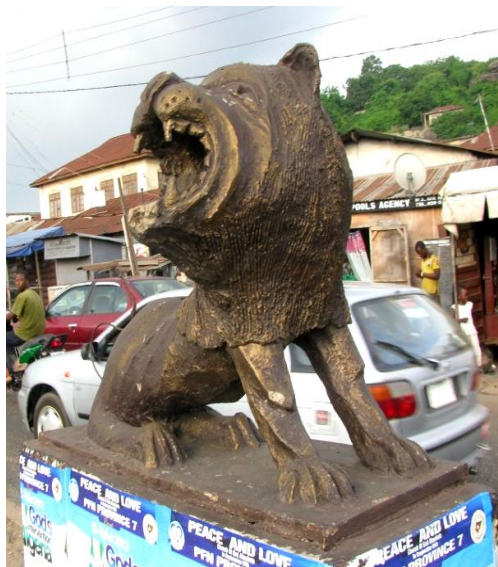
Figure 6: Lion , Cement, (120cm), 2007 Oke-Itoku Junction, Abeokuta