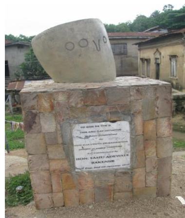
Figure 16: Ikoko Aro , Concrete, (60cm), 2011 Odo-Oja, Emere, Abeokuta Photograph: Paul Seyi-Gbangbayu, 2012