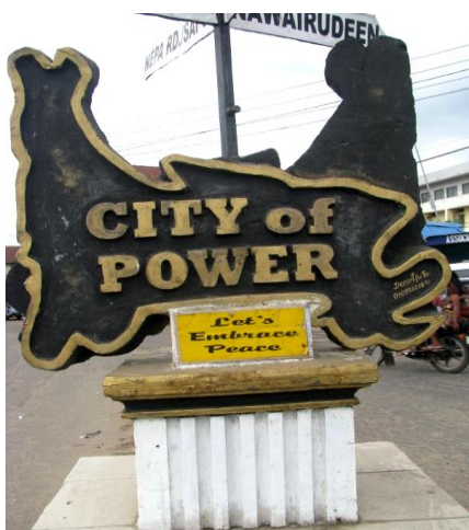
Figure 12: Peace , Map of Ogun State, Concrete, (230cm), 2009, Isabo, Abeokuta