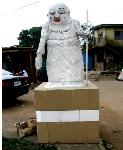
Figure 8: Gelede , Concrete, (125cm), 2006, Ago-Egun, Abeokuta