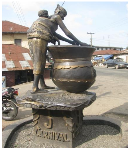
Figure 10: Iya Alape , Concrete, (180cm), 2005, Ijemo, Abeokuta Photograph: Paul Seyi-Gbangbayu, 2012