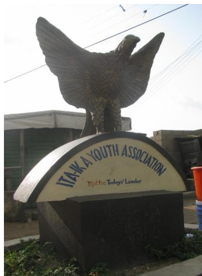
Figure 1: The Eagle , Concrete, (90cm), 2001, Ita-Aka, Abeokuta

Tuesdays preceding New Year or after New Year were initially used for the carnivals. However, later, the groups increased in numbers, each of them later decided appropriate time for their ceremony. The festive periods such as: Christmas, New Year, Easter and Muslim festivals especially Eid-el-Fitri (Ileya) are used.