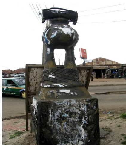
Figure 13: Ise Wa , Concrete, (120cm), Ijaye, Abeokuta