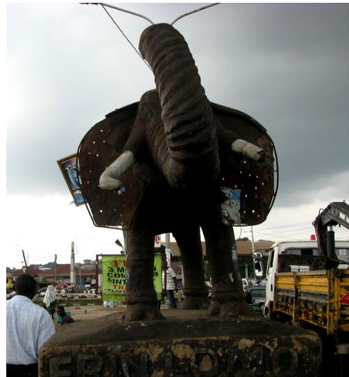
Figure 5: Erinlomo , Cement, (180cm) Adatan Round about, Abeokuta, 2003