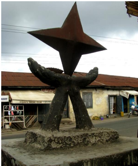
Figure 4: Golden Stars , Concrete and Metal, (198cm), 2009, Itoko, Abeokuta

iconography, thematic and contextual bases. As in the traditional Yoruba art style, western rule of measure is not enforced in carnival sculptures production. Yet, the style in form construction lacked consistency found in Yoruba traditional style (figures 5 and 6). While many of the carnival sculpture artists tend to follow Yoruba art canon some were actually struggling to achieve success in application of western rule of measure. They were either elongated or compressed, perhaps made without a conscious particular stylistic consideration. Facial structures in human figure such as eye, nose and mouth were mere representation in caricature form. Human hands that were mostly represented in different poses were usually schematized and poorly finished (figure 7). Draperies in figures (figure 8 and 9) were not detailed in representation and all postures are rigid and frigid. Their zoomorphic figures are more expressed and detailed in treatment than the antropomorphic ones (figures 5 and 6).