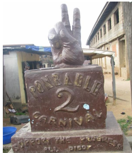
Figure 11: Victory , Concrete, (65cm), Itoko, Abeokuta Photograph: Paul Seyi-Gbangbayu, 2012