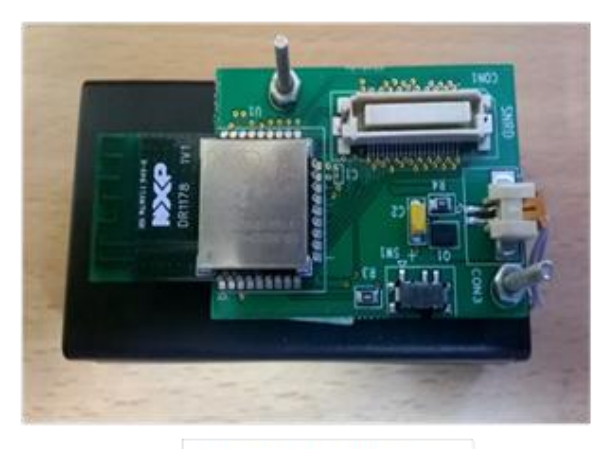
Figure 2.0 Radio module