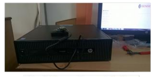
Figure 3 Gateway module connected to PC