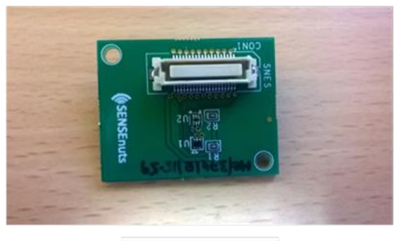
Figure 4 Sensor module